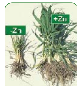
Figure 1: Wheat plants grown with (+Zn: 50 kg ZnSO 4 /ha) and without (-Zn) Zn fertilization in Central Anatolia on a zinc-deficient soil.

Currently, a large number of people rely on cereal crops as a major source of daily calorie intake. It is therefore anticipated that this NATO-Zinc project, which uses agricultural practices to address public health while improving crop production, can be applied to other zinc-deficient areas of the world. The IFA (International Fertilizer Industry Association) recognized the contribution of this successful project to human nutrition and crop production in Turkey by giving it an International Crop Nutrition Award.